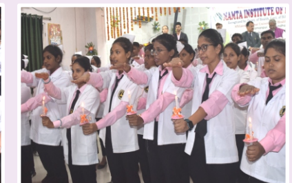
CAPPING & OATH CEREMONY